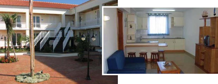
Encosta do Mar Apartments - Ribeira Grande